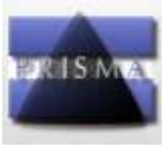
Figure 1 - PRISMA 2009 Flow Diagram